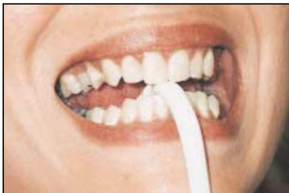
Figure 2. The potential for microorganisms to be pulled back up through the tube into the mouth is decreased if patients close only their teeth around the suction tube.

I cringe when my children’s hygienist and many of my colleagues ask their patients to “suck on Mr. Thirsty.” I had read many years ago that there was a potential for microorganisms to be pulled back up through the tube into the mouth when a seal was formed around the suction tip. Infection control guidelines now tell us to flush each unit every morning, following each patient, as well as replacing the filters routinely. But how many of us do that? Research has been conducted here in the United States as well as in Canada beginning in 1993. It has been documented that trace amounts of biofilm are being pulled back into the tip and potentially into the mouth. The American Dental Association has made a statement regarding saliva ejectors, which can be found on its website dated September 8, 1999 ( http://www.ada.org/prac/position/ejectors.html ). It states that there are no adverse health effects from sucking on the tip, but it recommends asking the patient not to close his or her lips around the tip during the procedure.